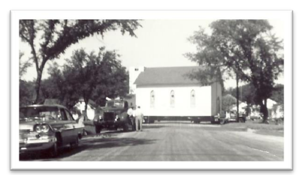
The old building arrives in Sauk City - 1959