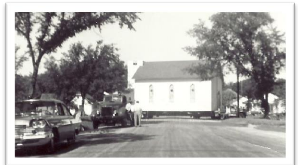
The old building arrives in Sauk City - 1959

In May of 1959, Calvary Baptist Church purchased a Denzer-area country church building, "The Zion Evangelical and Reformed Church" for $1,900. The building was soon moved to the Water Street location. The purchase included 16 pews, flags, some chairs, and a communion table.