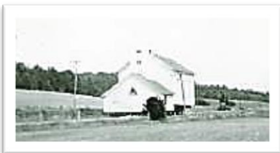
The old church building being moved

In May of 1959, Calvary Baptist Church purchased a Denzer-area country church building, "The Zion Evangelical and Reformed Church" for $1,900. The building was soon moved to the Water Street location. The purchase included 16 pews, flags, some chairs, and a communion table.