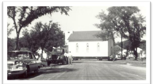
The old building arrives in Sauk City - 1959

$1,900. The building was soon moved to the Water Street location. The purchase included 16 pews, flags, some chairs, and a communion table.